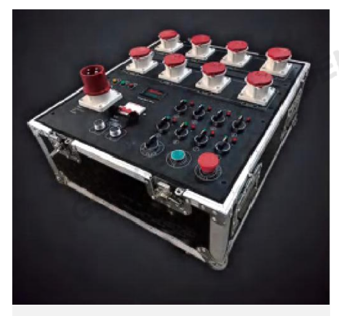
Flight Case Controller

Mode controllers are generally 4-way, 8-way, 12-way, 24-way, 36-way, flight case controller, portable controller. V6 controller and V6 + controller. Flight case or vertical control cabinet of corresponding size according to different models. The Mode controller only needs one button to control the single action or group linkage of the electric hoist. Each controller has an electric hoist pre-set system with panel/remote control as standard device. Mode electric hoist has many functions, such as low voltage control, adjustable limit switch and motor overheat protection, etc., which can be operated by this controller with only one power cable. The Mode controller can be connected to a component control system and can control up to 40 pcs electric hoists